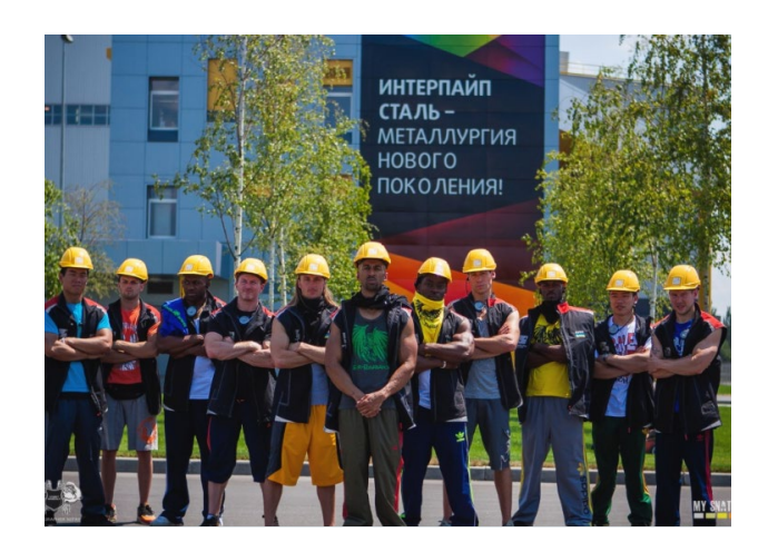
Visit of worldwide workout sportsmen