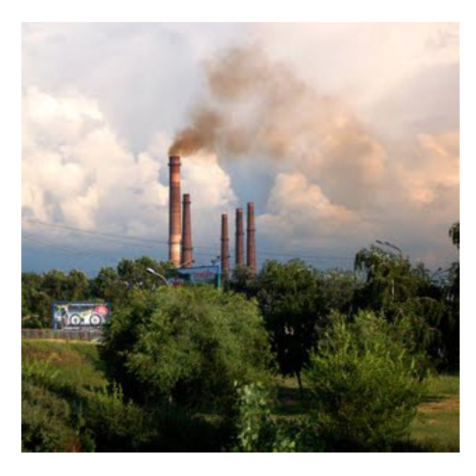
Interpipe NTRP open-hearth production shop was closed in 2012.

The innovative Interpipe Steel plant was launched in 2012, with USD 1 billion invested in its construction.