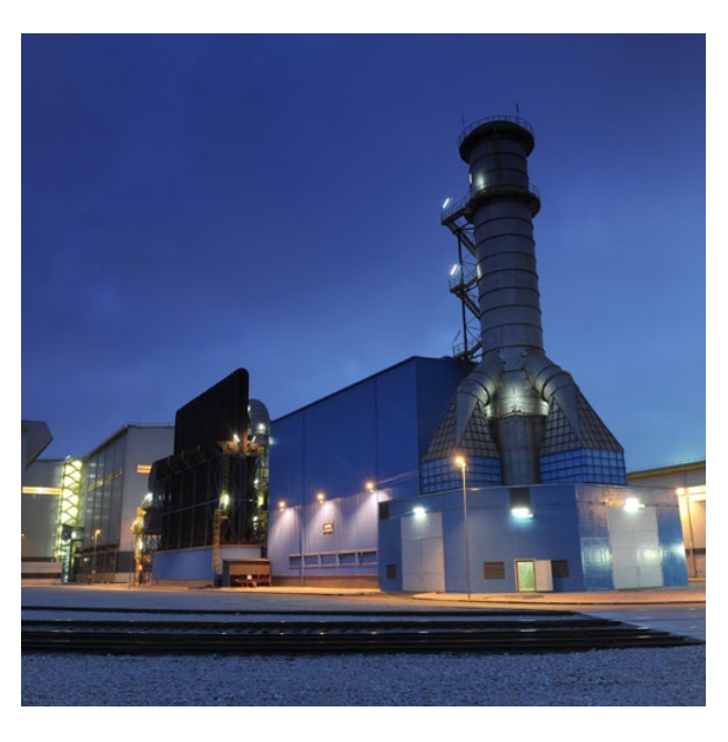
Interpipe Steel discharges purified gases into the atmosphere