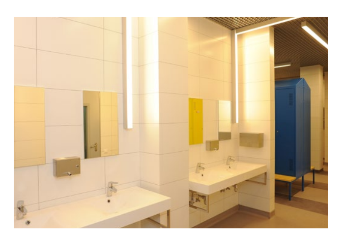
The mill has introduced a unique production culture to ensure that employees feel comfortable at work