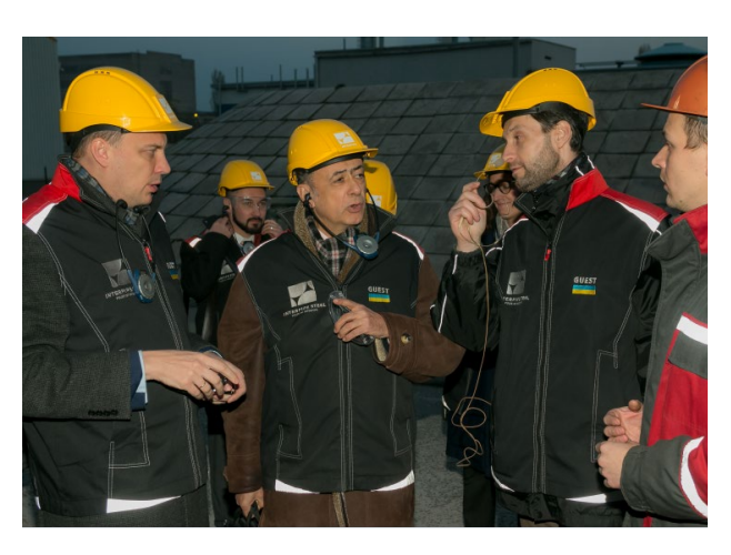
Visit of the EU Ambassador to Ukraine