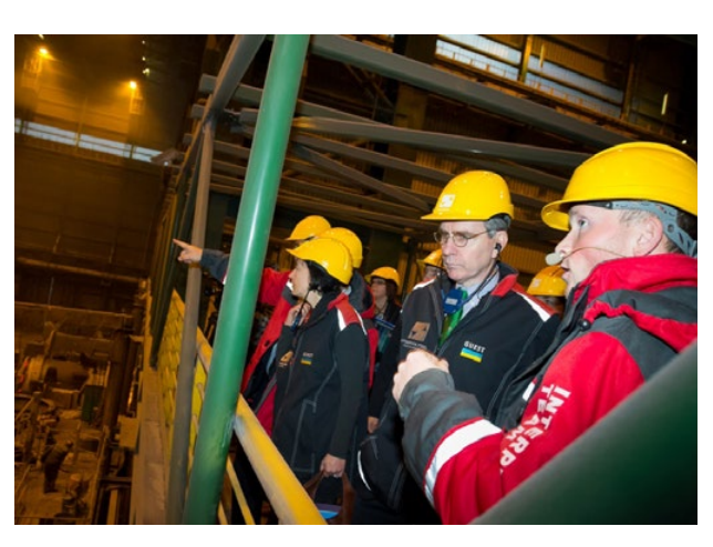
Visit of the US Ambassador to Ukraine