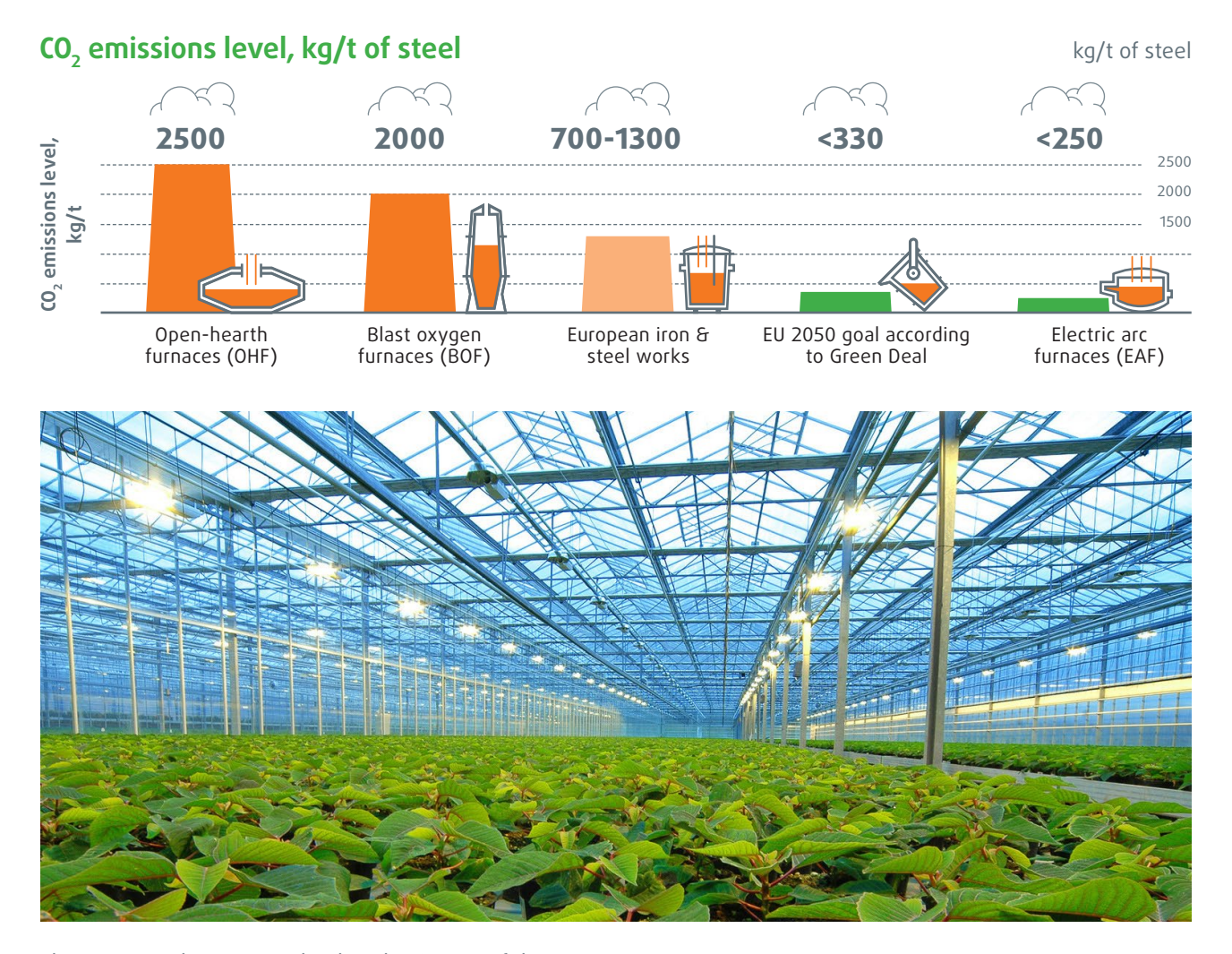
The Green Deal envisages the decarbonization of the EU economy

The country of Ukraine is going to face the same challenges as well. In April 2021, the Ukrainian Government launched its Nationally Determined Contribution 2 (NDC2) - a commitment to reduce CO2 emissions by 2030 by at least 65% as compared with 1990 levels. Respectively, the minimum volume of investments needed by all sectors of the Ukrainian economy is estimated at 102 billion euros. And the steel industry is expected to be at the forefront of the decarbonization process.