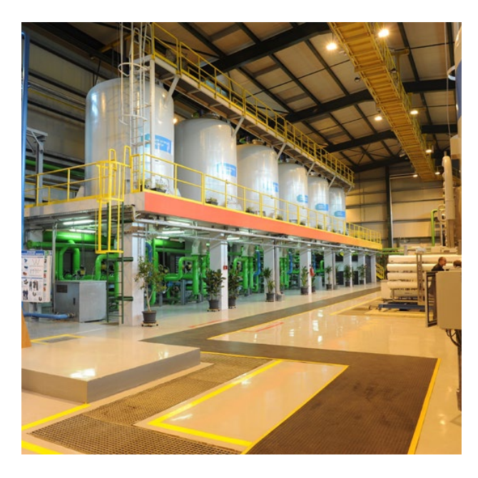
The water in the technological process is constantly purified and reused

18 m³/t _____ consumption of the natural gas – 8 time reduction